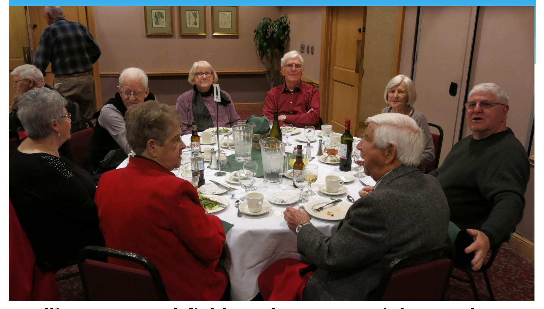
Collinsons, Crutchfields, Hebsons, & Wriglesworths