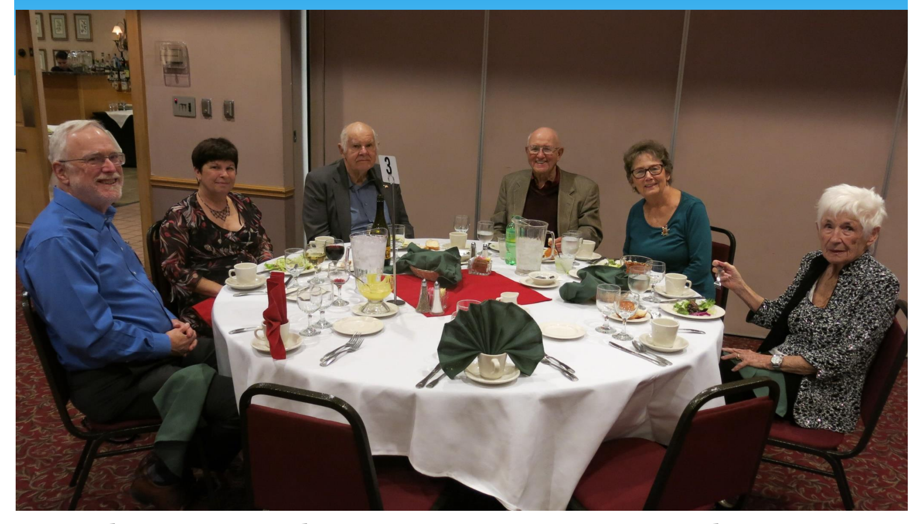
Bernham & Norberg, Brownies, & Steels